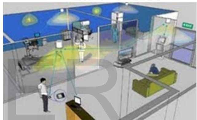
Fig3: overview of visual light communication

LED illumination can be used as a communication source by modulating the LED light with the data signal. The LED light appears constant to the human eye due to the fast flickering rate. The high data rate can be achieved by using high speed LED’s and appropriate multiplexing techniques. Each LED transmits at a different data rate which can be increased by parallel data transmission using LED arrays. Many different reasons exist for the usage of LED light in spite of fluorescent lamp, incandescent bulb etc which are available.