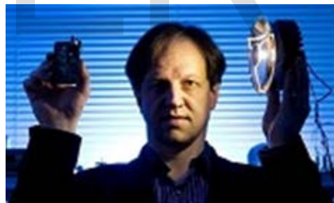
Fig1: Haraald haas

Research into VLC has been conducted in earnest since 2003, mainly in the UK, US, Germany, Korea and Japan. Experiments have shown that LEDs can be electronically adapted to transmit data wirelessly as well as to provide light. VLC is faster, safer and cheaper than other forms of wireless internet, advocates say -- and so could eliminate the need for costly mobile-phone radio masts.